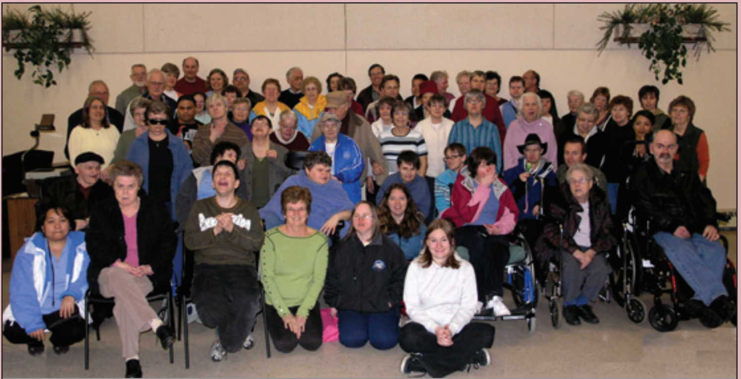
Friendship at Trinity

One of the Friendship groups meet at Trinity Christian Reformed Church in Abbotsford where approximately 40 – 50 people connect every Tuesday at 7 pm in the Fellowship Hall and have done so for the past 25 years. The evening begins with worship and praise – lots of it!! Singing, clapping hands and playing musical instruments all contribute to powerful worship. The story teller leads the Bible story which involves group participation; this might even include a drama presentation. Students and volunteers spend one on one time together in prayer,